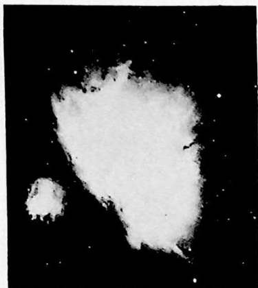
Cover photograph: Great Nebula in Orion, photographed with the 200-inch Hale telescope at the Palomar Mountain Observatory, California.